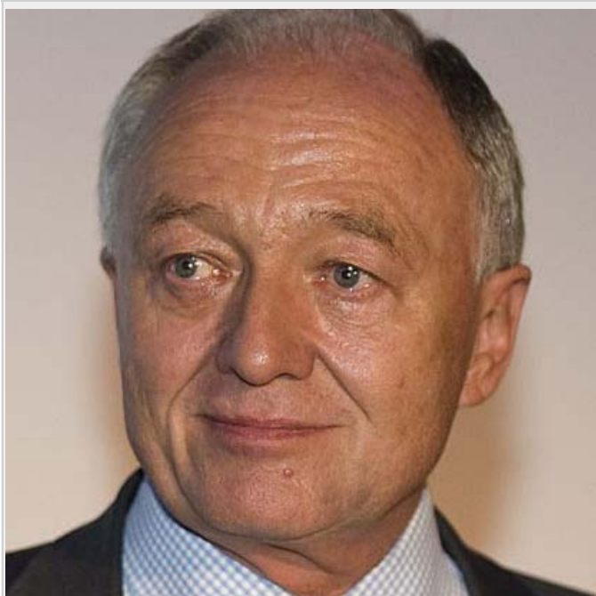
Fierce critic: mayoral candidate Ken Livingstone is against Coalition plan to save cash

Local authority - Number of developments* - Number of flats